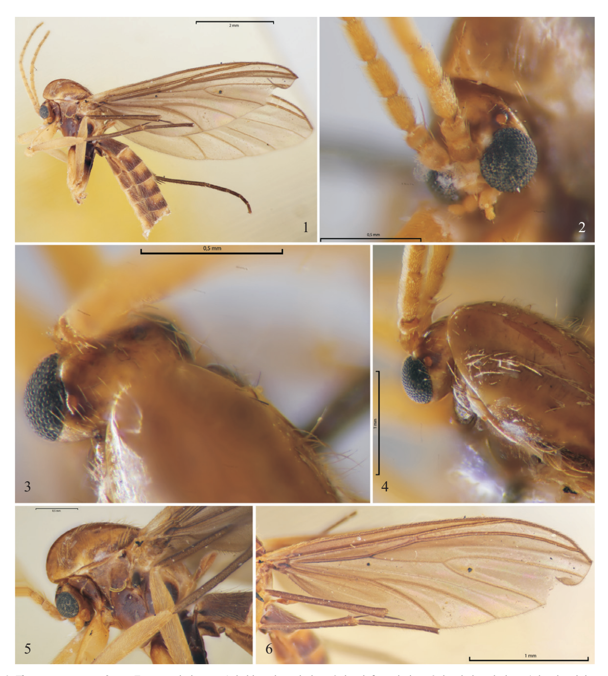
Figs. 1–6. Thoracotropis cypriformis Freeman, holotype: 1, habitus, lateral view; 2, head, frontal view; 3, head, dorsal view; 4, head and thorax, dorsal view; 5, thorax, lateral view; 6, left wing.

only a phylogenetic analysis considering all putative leiine genera, manotines, gnoristines, and other outgroups could render a reliable solution. This study is still not available and the redescription of this genus is a way of providing information towards a better understanding of the subfamily.