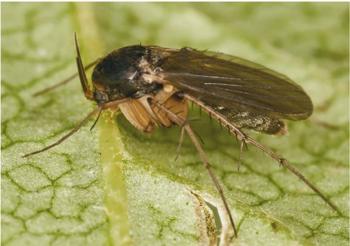
Figs. 3–4: 3 – female of Dynatosoma majus Landrock, 1912; 4 – female of Epicypta torquata Matile, 1977.