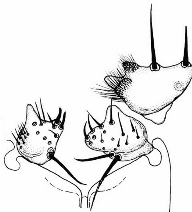
Fig. 5: Mycetophila eppingensis Chandler, 2001, male terminalia in ventral view.