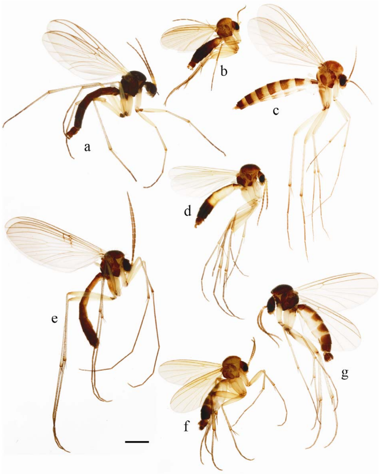
Fig. 8: A sample of fungus gnats new to Slovak Republic. a, Boletina nasuta (Haliday, 1839); b, Phronia persimilis Hackman, 1970; c, Polylepta zonata Zetterstedt, 1852; d, Brevicornu verralli (Edwards, 1925); e, Mycomya alpina Matile, 1972; f, Phronia signata Winnertz, 1863; g, Trichonta subterminalis Zaitzev & Menzel, 1996. Scale bar = 1 mm.