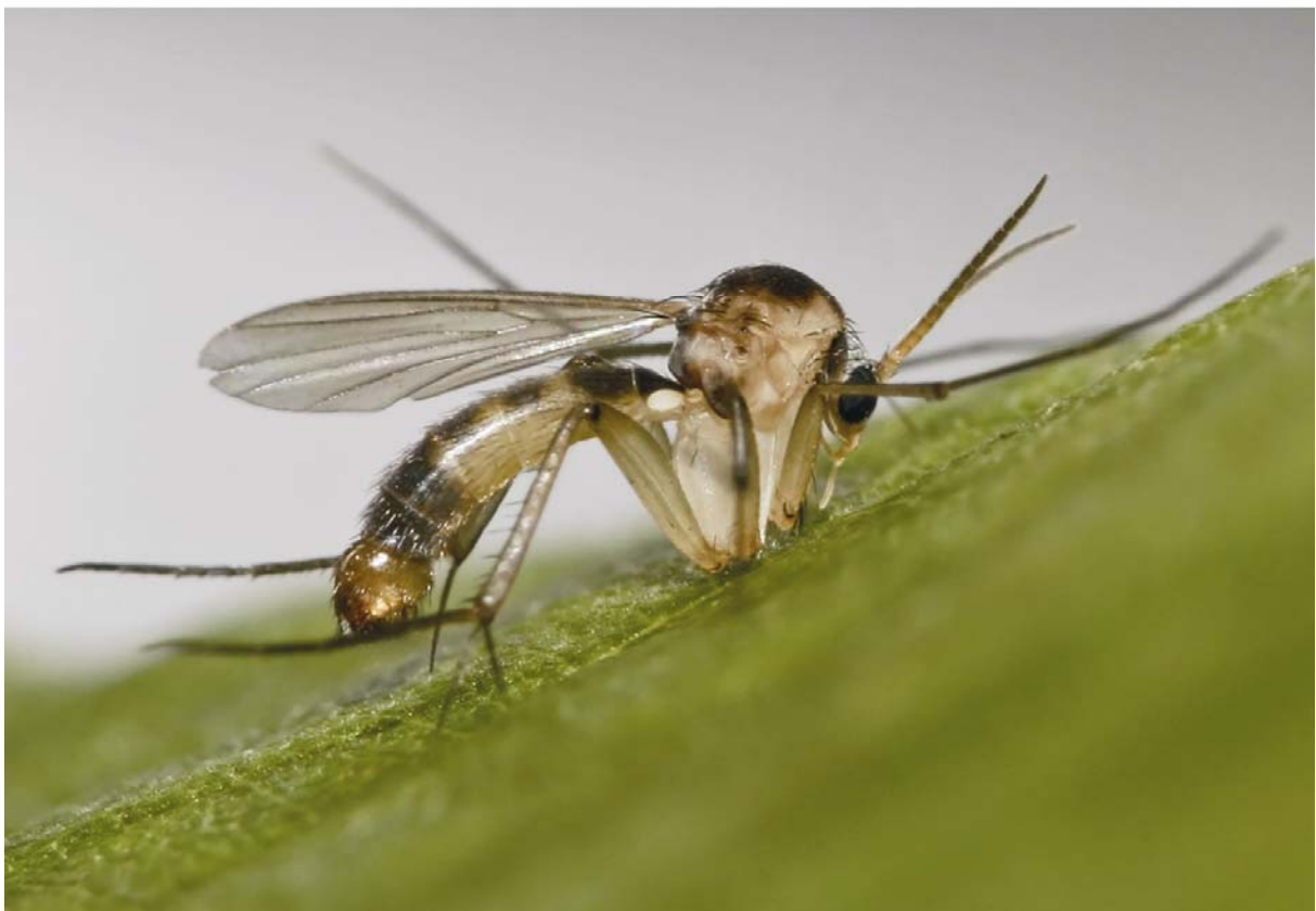
Figs. 1–2: 1 – male of Leia hungarica Ševčík & Papp, 2003; 2 – male of Allodia westerholti Caspers, 1980.